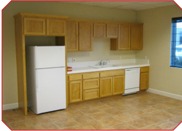
Large kitchen and break room area