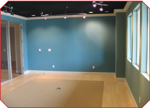
Large conference room with task lighting