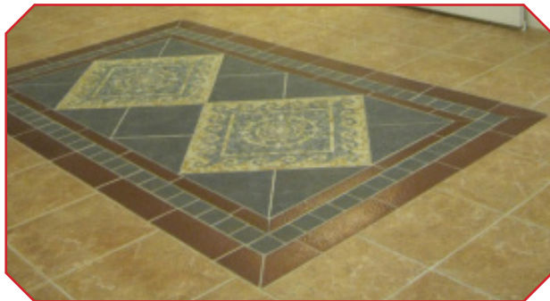
Custom tile floor