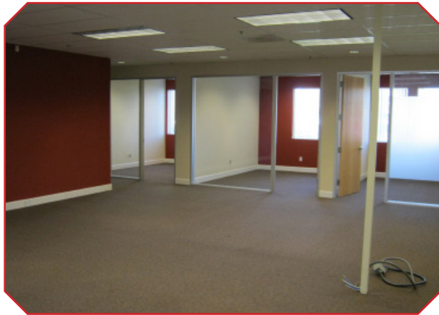
Large work areas