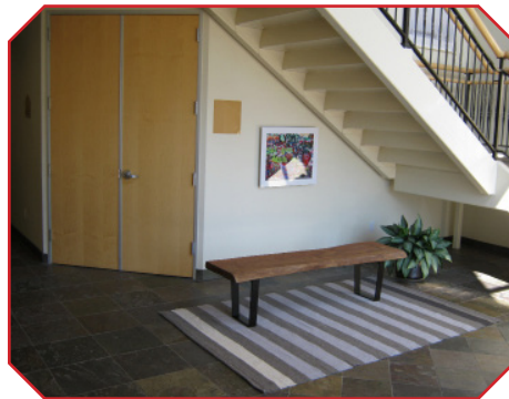
Slate floor lobby with suite entrance and elevator served.