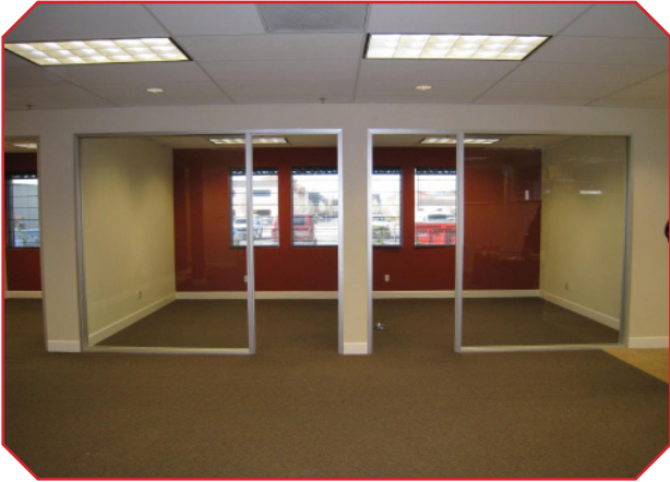
Open, bright offices with large work area